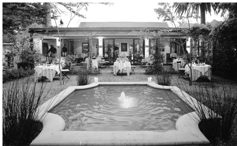
La Colombe is listed at No. 12 on the 2010 San Pellegrino list of the World's 50 Best Restaurants.